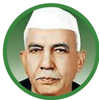
CHARAN SINGH CHOUDHARY 5TH PRIME MINISTER OF INDIA ( 1979-1980)

Kisan Divas (National Farmers Day) Kisan Divas or National Farmer's Day is observed across India on December 23. The day honours Chaudhary Charan Singh, the 5th Prime Minister of India born on this day. It was in the year 2001. Choudhary Charan Singh, regarded as farmer's leader, introduced many policies to improve their lives. Farmers are considered as the backbone of India's economic development. Kisan Divas is being celebrated every year to promote awareness among people about farmers' importance to society. Several events are organised across the country on Kisan Divas to encourage farmers and celebrate their contribution to the country.